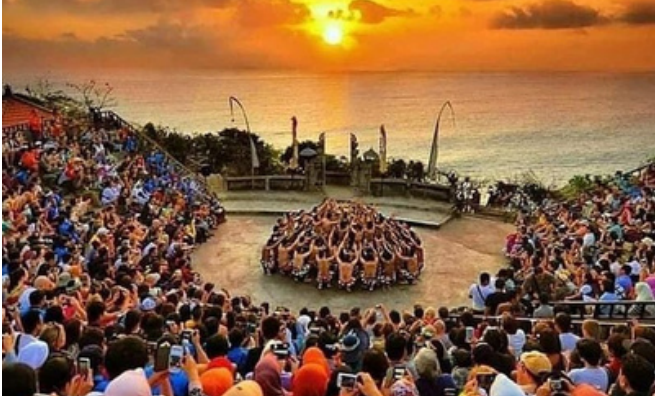
KACAT FIRE DANCE