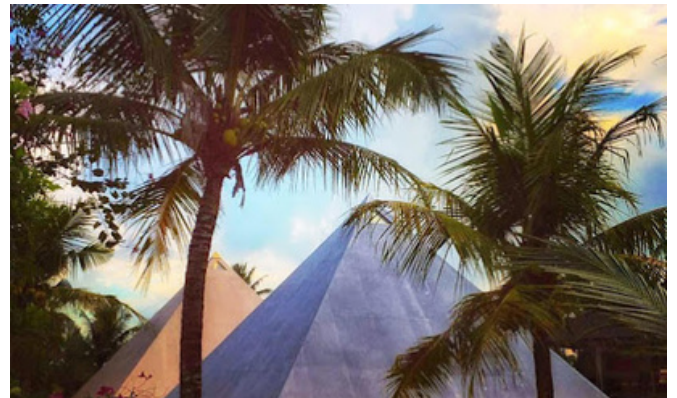
PYRAMIDS OF CHI