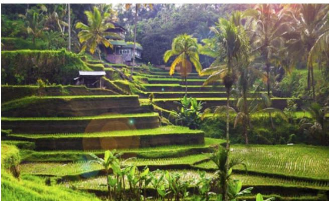
TEGALLALANG RICE TERRACE